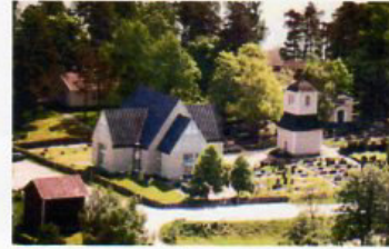
Bromarv, the place where I was listening

Clonaslee Parish Parochial House The Green Clonaslee Co. Laois IRELAND